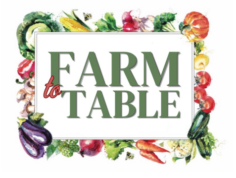
Farm to Table Dinner Saturday, October 12 Soulful Prairies, Woodstock